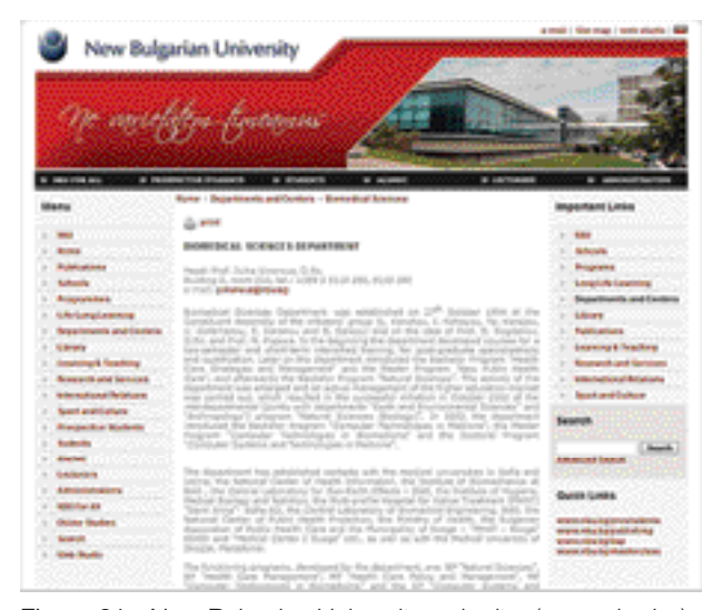
Figure 01 - New Bulgarian University web site. (www.nbu.bg)

The main stakeholders in Bulgarian health system are the Parliament, the Ministry of Health, the National Health Insurance Fund and the Higher Medical Council. A num-