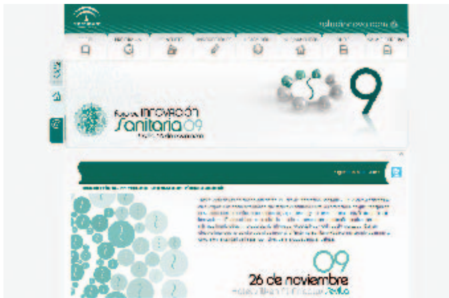
Figure 04 - Salud Innova Portal.

important role they have in the Bank of Innovative Practices.