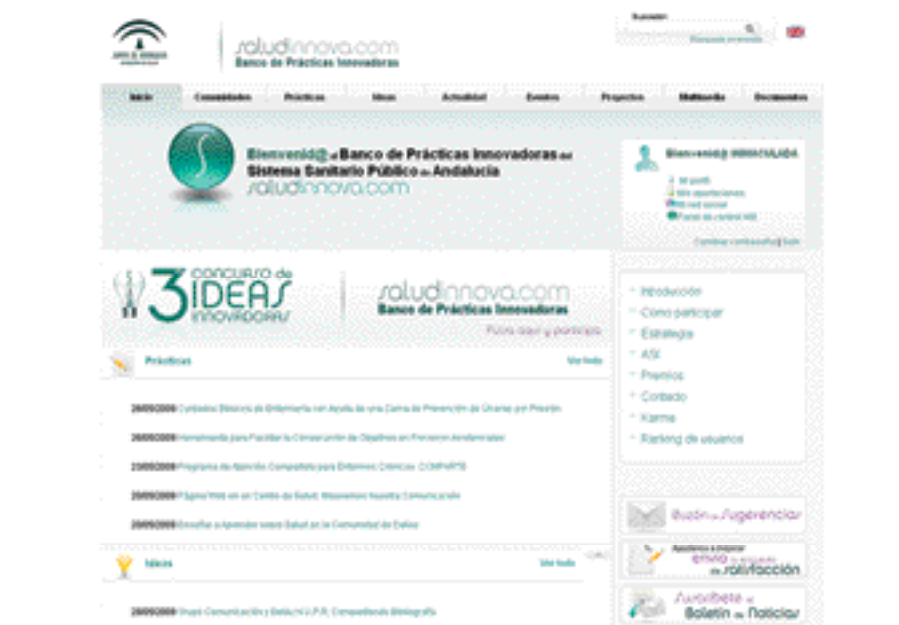
Figure 03 - Bank of Innovative Practices Salud Innova portal