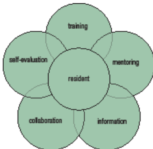
Figure 01 - Conceptual scheme of the teaching approach and knowledge management of the EIRPortal.

The EIRPortal is the reference web platform for training, communication and collaboration between the intern resident specialists of Andalusia and all the professionals involved in specialized training. The project started in 2006 and together with other projects is included in the Training Strategic Plan of the Andalusian Public Health System 1 promoted by the Health Department of Andalusia. In this Plan the EIRPortal is defined as a knowledge management tool and a training platform for the development of complementary transversal competences of the training programs of the different specialties. The portal welcomes the design and implementation of teaching methodologies, evaluation methodologies, electronic portfolios, collaboration group, etc.