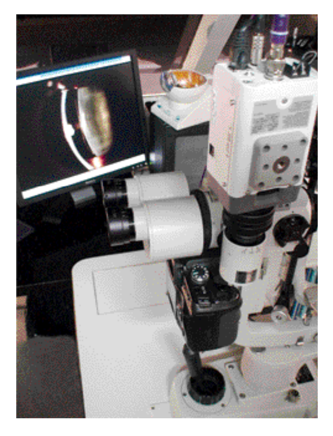
Figure 02 - Slit lamps equipped with dynamic IP Mpeg-4 videocameras and 10 Mpx digital cameras together with the software to carry out videoconferences from the PC with USB webcam.

cal location. This tool has also proven to be essential for monitoring the work done by medical residents and for the technical staff in charge of the administration and maintenance of the network, because these programs generated a friendlier environment for following the users along their learning curve, that can only be managed using the positive aspects of this tool.