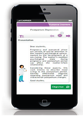
Figure 1 - Screen Presentation Mobile X Desktop.